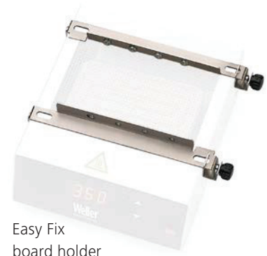
Easy Fix board holder